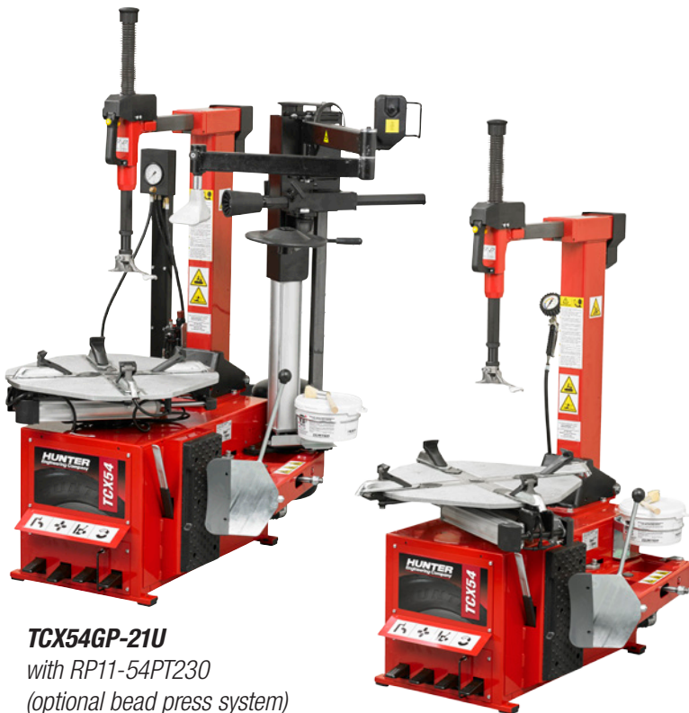
TCX54GP-21U with RP11-54PT230 (optional bead press system)

Some dimensions, capacities and specifications may vary depending on tire and wheel configurations.